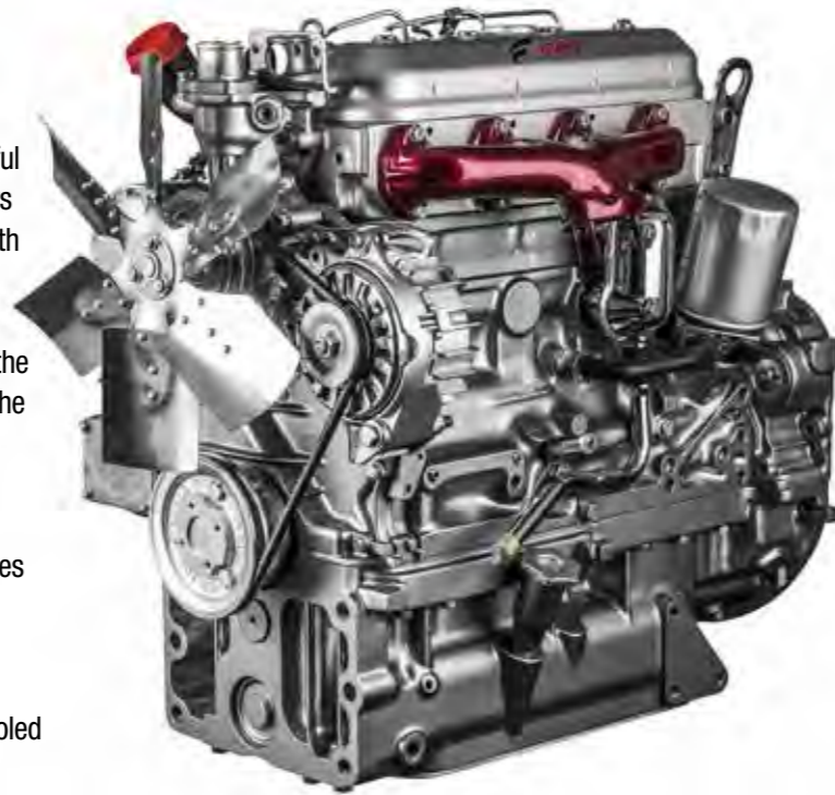
FPT S8000: proven technology!

Coupled with the turbo pre-cleaner, the water cooled engine ensures excellent cooling and high fuel efficiency : -5% compared with the previous model.